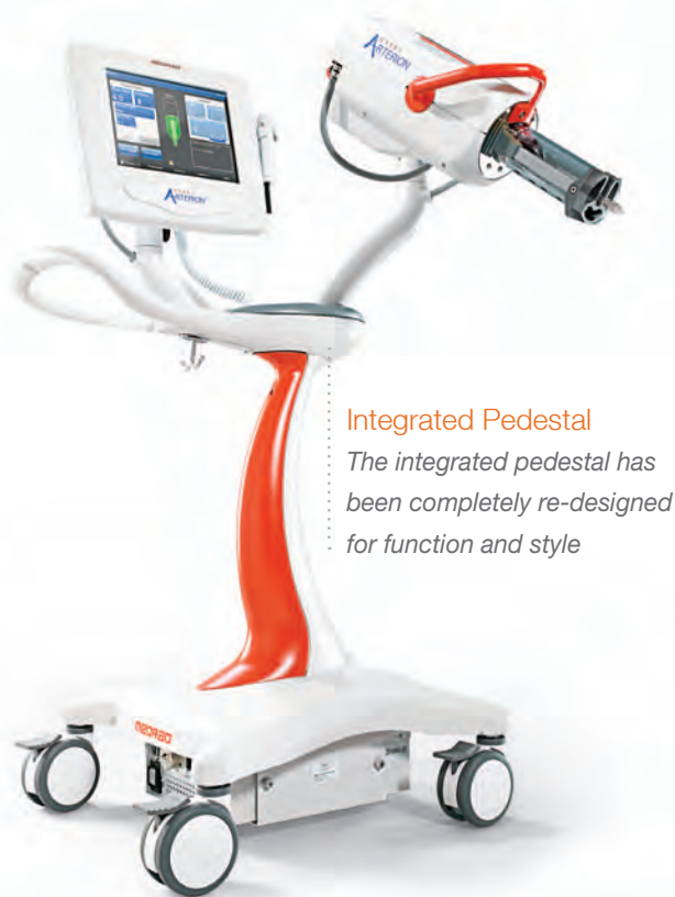
Integrated Pedestal The integrated pedestal has been completely re-designed for function and style

Arterion™ offers multiple configurations for maximum configuration flexibility