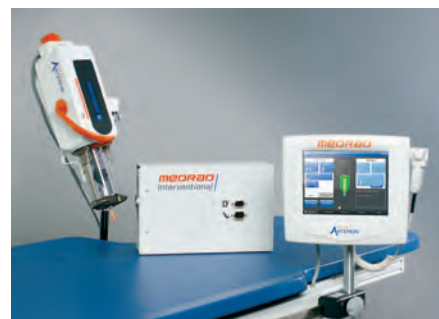
Table Mount The small power supply allows mounting flexibility – under the table, in control room, in store room